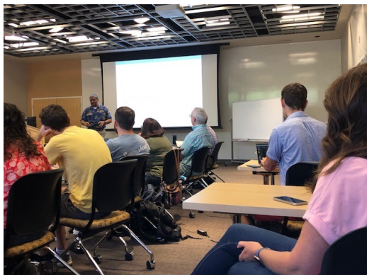
IBS class in progress-My view from the back row

This month I have the privilege of being a Teaching Assistant to two in-person theology classes as part of the Cru IBS program, Apologetics and Humanity/Christ/Salvation. I'm SO enjoying listening to the lectures with no homework (though I suppose correcting student homework is its own kind of homework). My favorite quote so far has been: