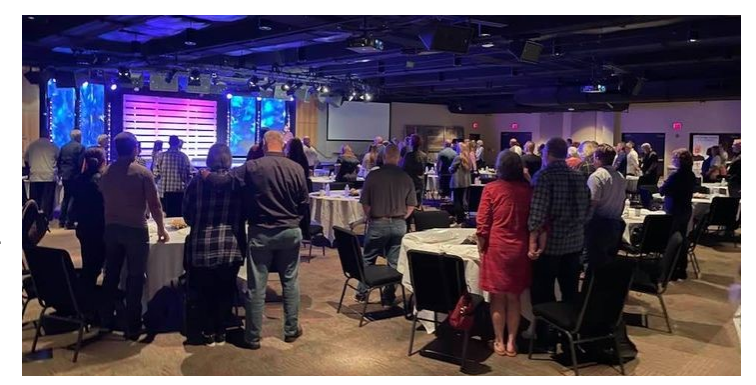
Starting off our Summit on Stepfamily Ministry with worship

try Leaders. These 130 individuals represented some 330,000 church goers across the country! It is our prayer that each of these represented churches will see a decrease in 'redivorce' as these leaders bring back what they have learned. In Him,