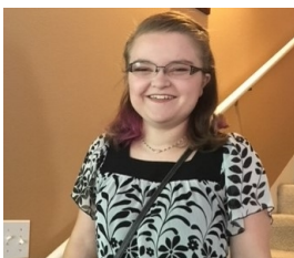
First day working at Rooker Library