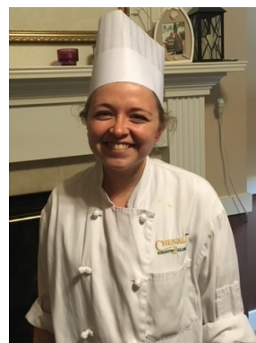
Heading to work at Chenal Country Club