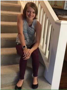
First day of SOAR Speech & Debate Club

math skills that she is learning, and I am excited for her to see how well equipped she truly is for college. She is applying to College of the Ozarks for next fall and currently plans to begin towards a Communications degree. She isn't exactly sure what direction that will take, but hopes that getting started will give her a better idea of career options.