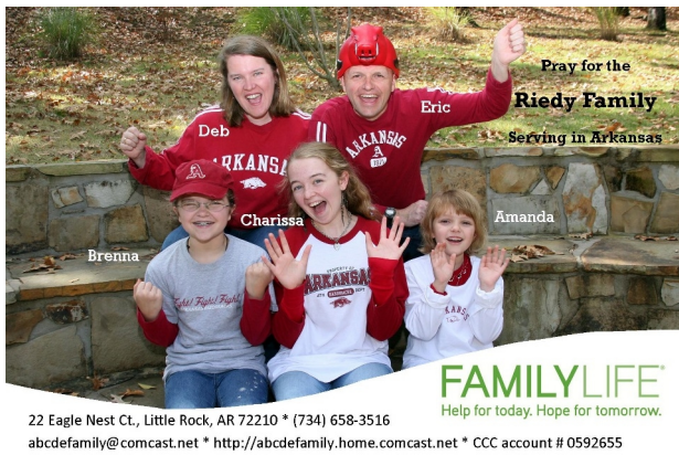
2010 was our first full year in Little Rock-we borrowed All this Razorback gear- still PSU fans after all!